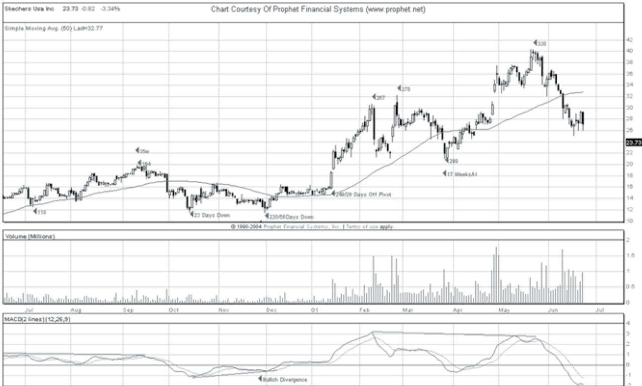
Figure 6.15 Skechers 50dma II

A large segment of the trading community uses the 50- and 200-period moving average. Another segment uses the 20 and 50. It is probably better to use the 20 if your time frame is smaller. But, the challenge is still the same. When you use moving averages, they are not always going to be lines in the sand. Only the strongest moves will validate them to the point where whipsaws are minimized. Moving averages do work best when they line up near a common Fibonacci retracement point. The problem is that many traders who use Fibonacci retracements pay no attention to moving averages. Conversely, many traders who use moving averages pay