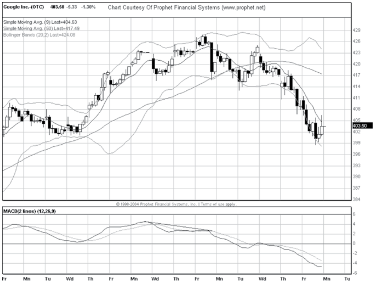
Figure 6.3 Hourly chart of GOOG

This time I am going to show you the scaled down hourly chart (Figure 6.3) so you can see the candle and bearish divergence situation going on