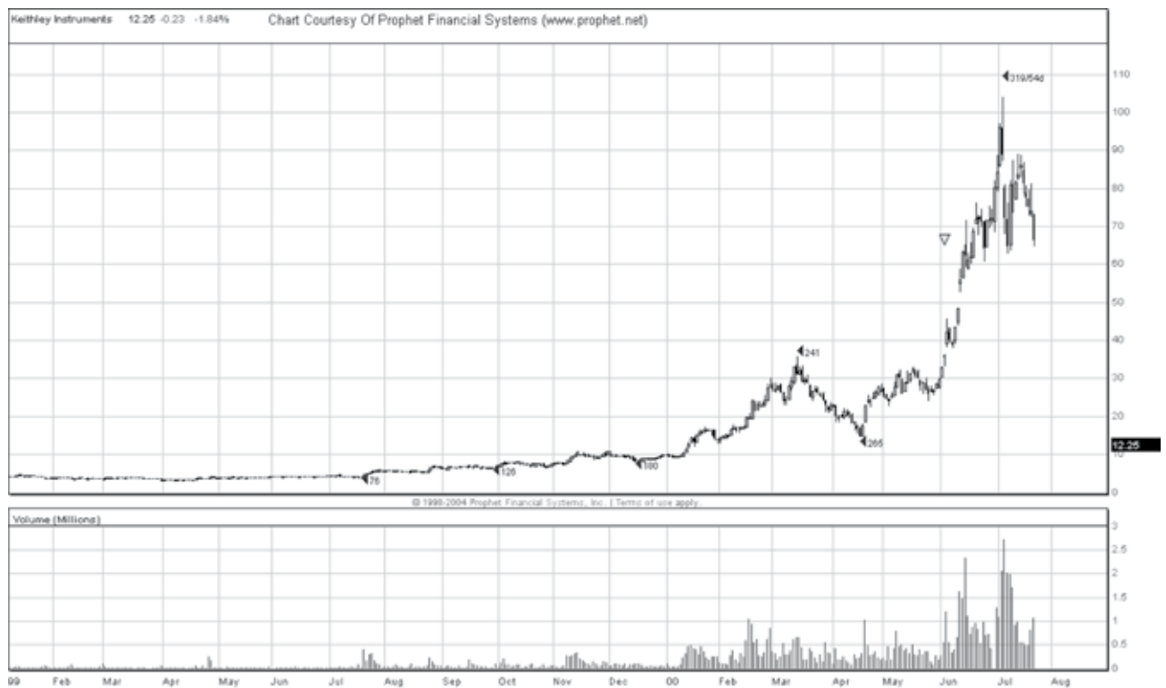
Figure 6.10 Keithley Instruments, whole advance

© 1998-2004 Prophet Financial Systems, Inc. | Terms of use apply.