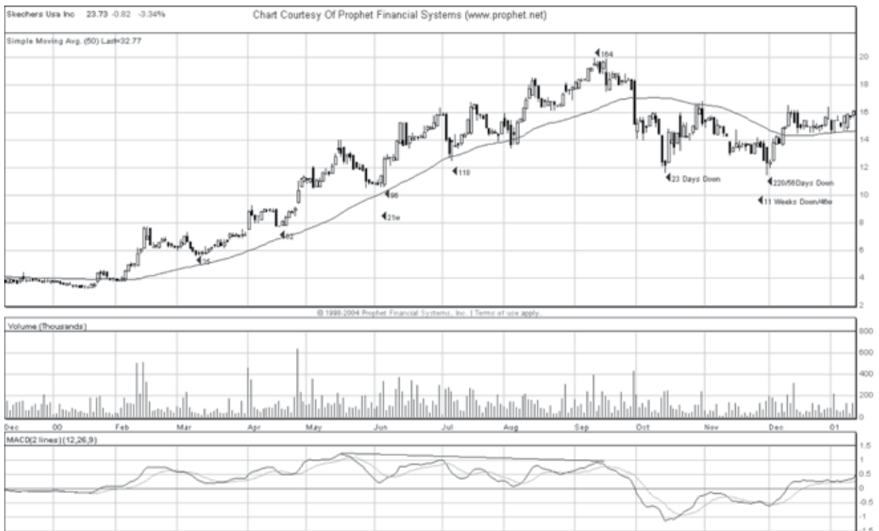
Figure 6.14 Skechers, with 50 dma

As we progressed off that low, we formed yet one more base that completed on the 29th day off the pivot (Figure 6.15), and the rest is history. The only thing I can add is that the final high is created when we get the